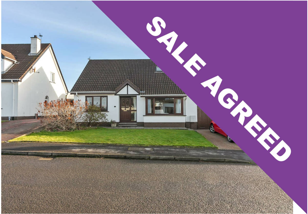
3 Bluefield Road, Carrickfergus, BT38 7XE