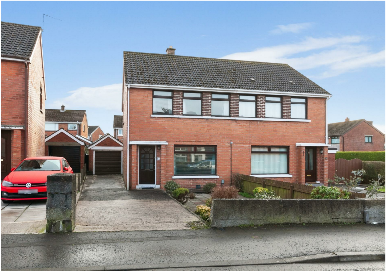
14 Carwood Park, Newtownabbey, BT36 5JU