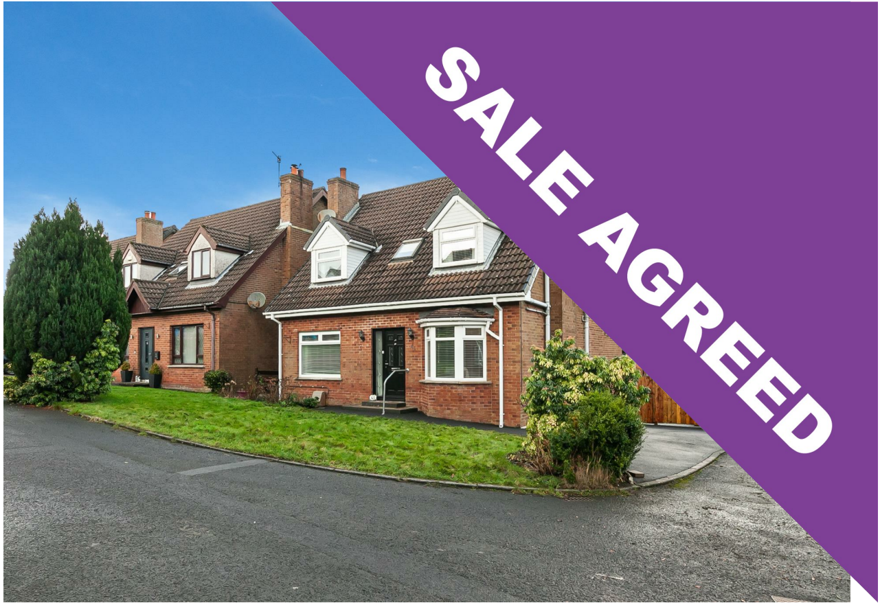
41 The Brackens, Newtownabbey, BT36 6SH