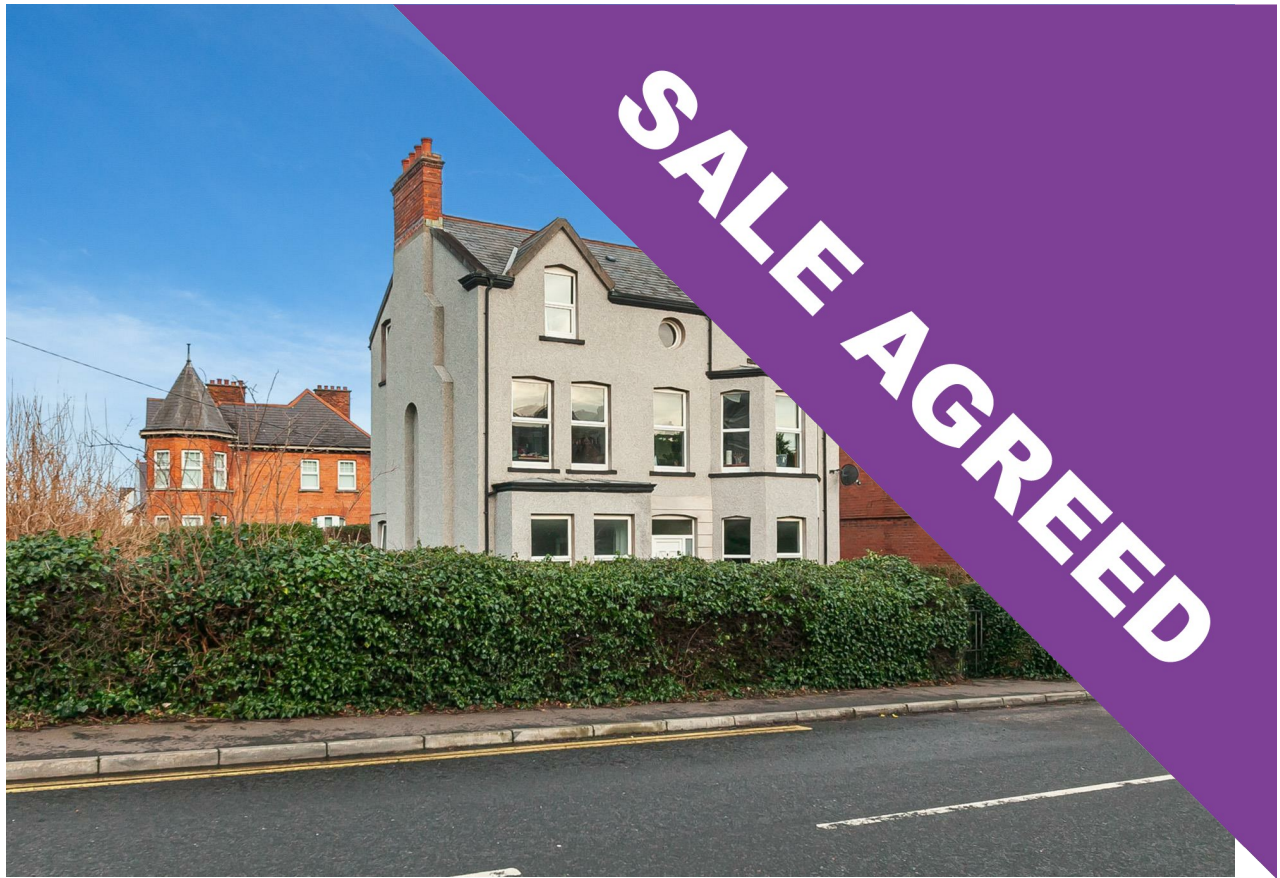
2a Balmoral Avenue, Whitehead, BT38 9QA