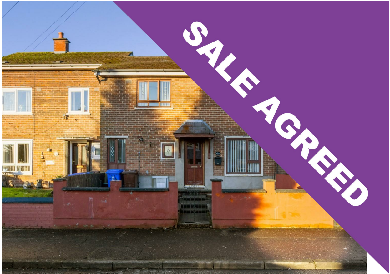
24 Mount Vernon Gardens, Belfast, BT15 4BQ