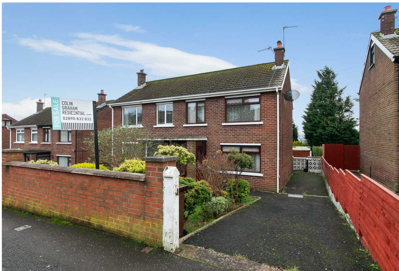
85 Church Crescent, Newtownabbey, BT36 6ET