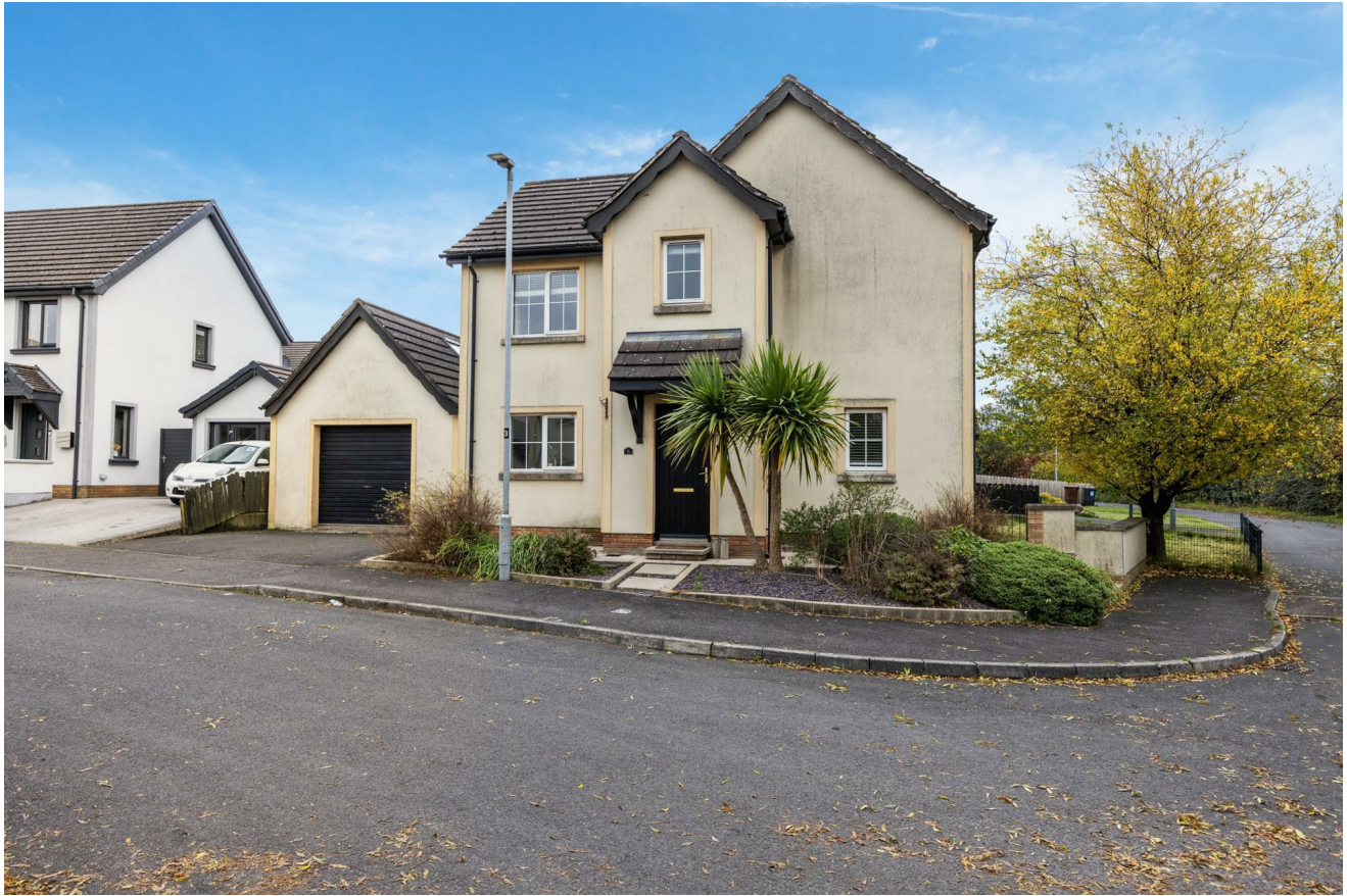
6 Castlebrook Way, Ballynure, BT39 9GY