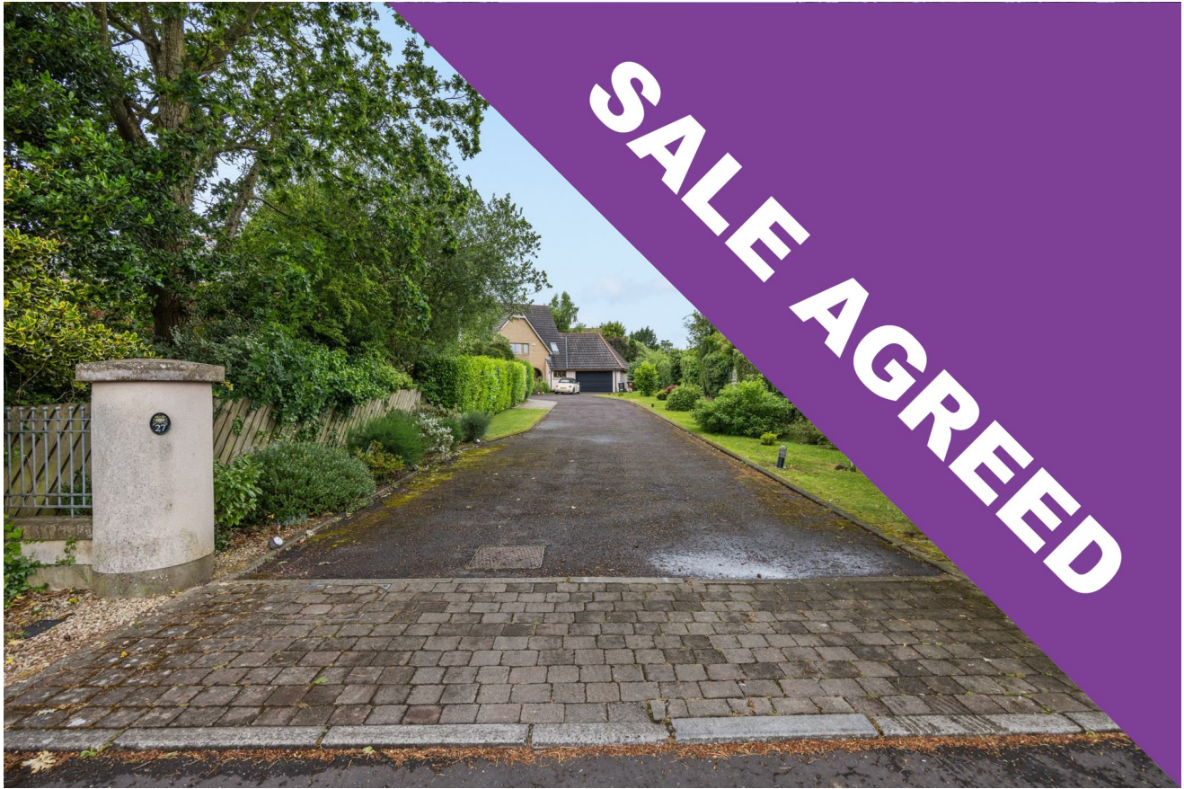
27 Lynda Avenue, Jordanstown, BT37 0NX