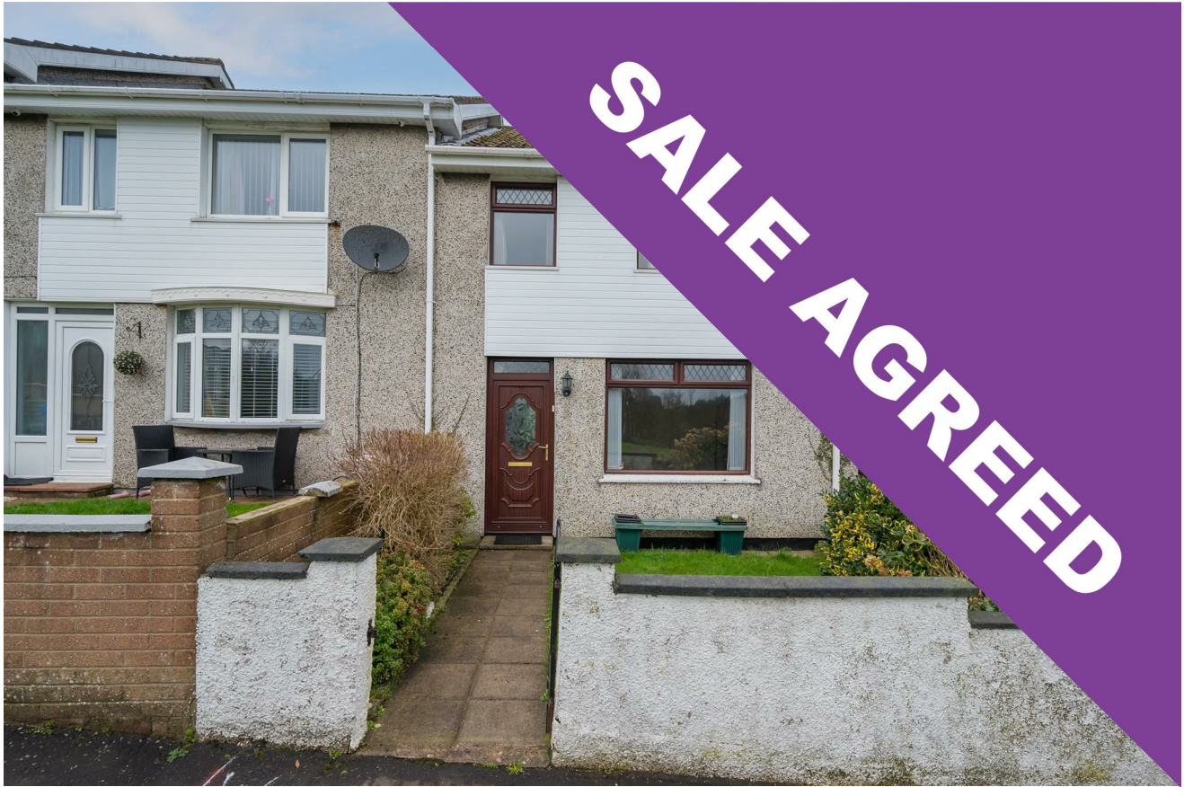
17 Lacken Gardens, Newtownabbey, BT36 6BJ