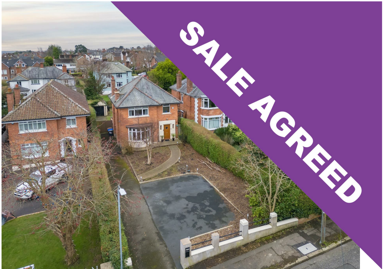
49 Waterloo Gardens, Belfast, BT15 4EY