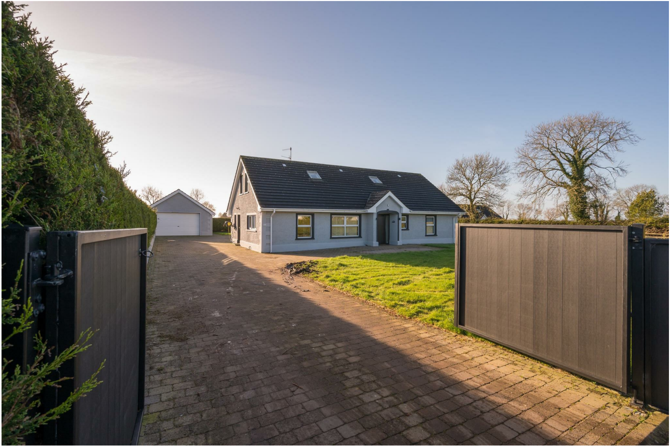
32a Crumlin Road, Crumlin, BT29 4AG