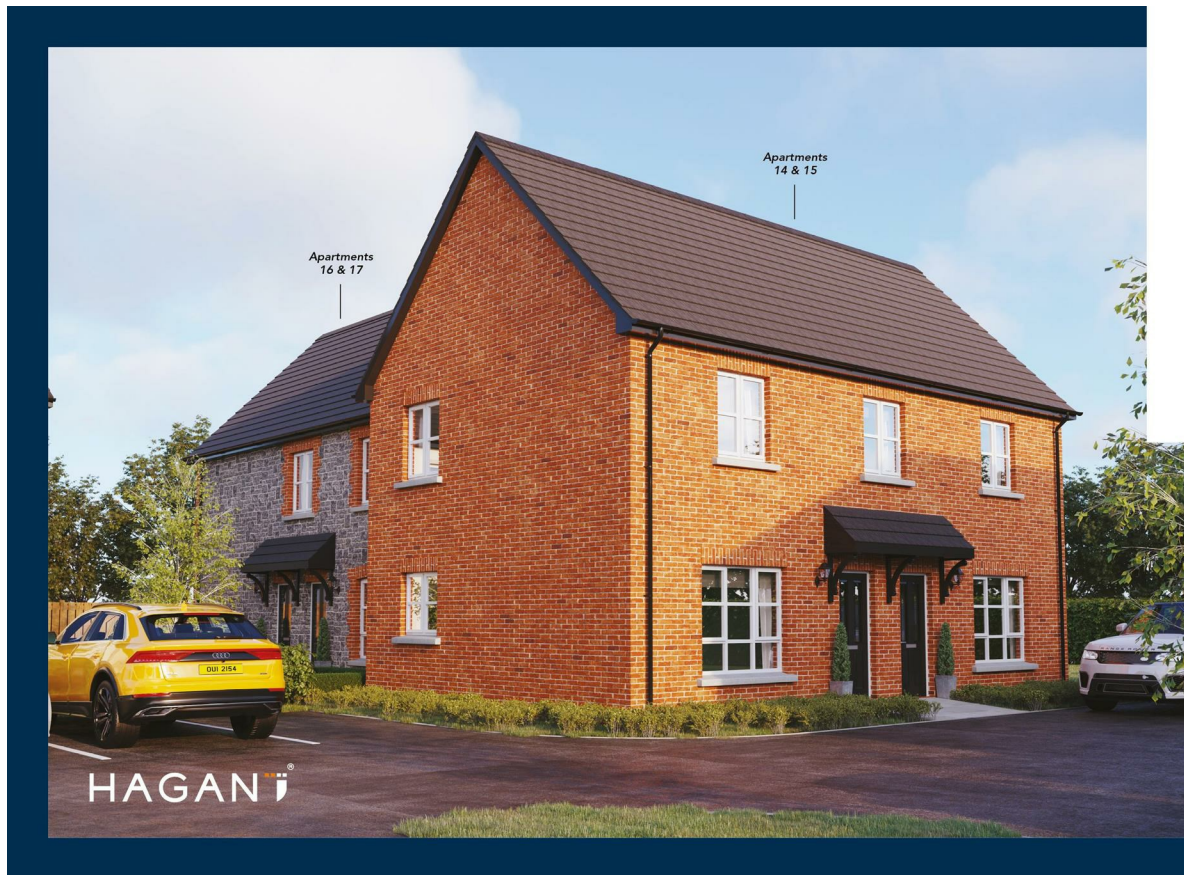
Site 15 The Rivington, Ballyveigh, Antrim, BT41 2FG