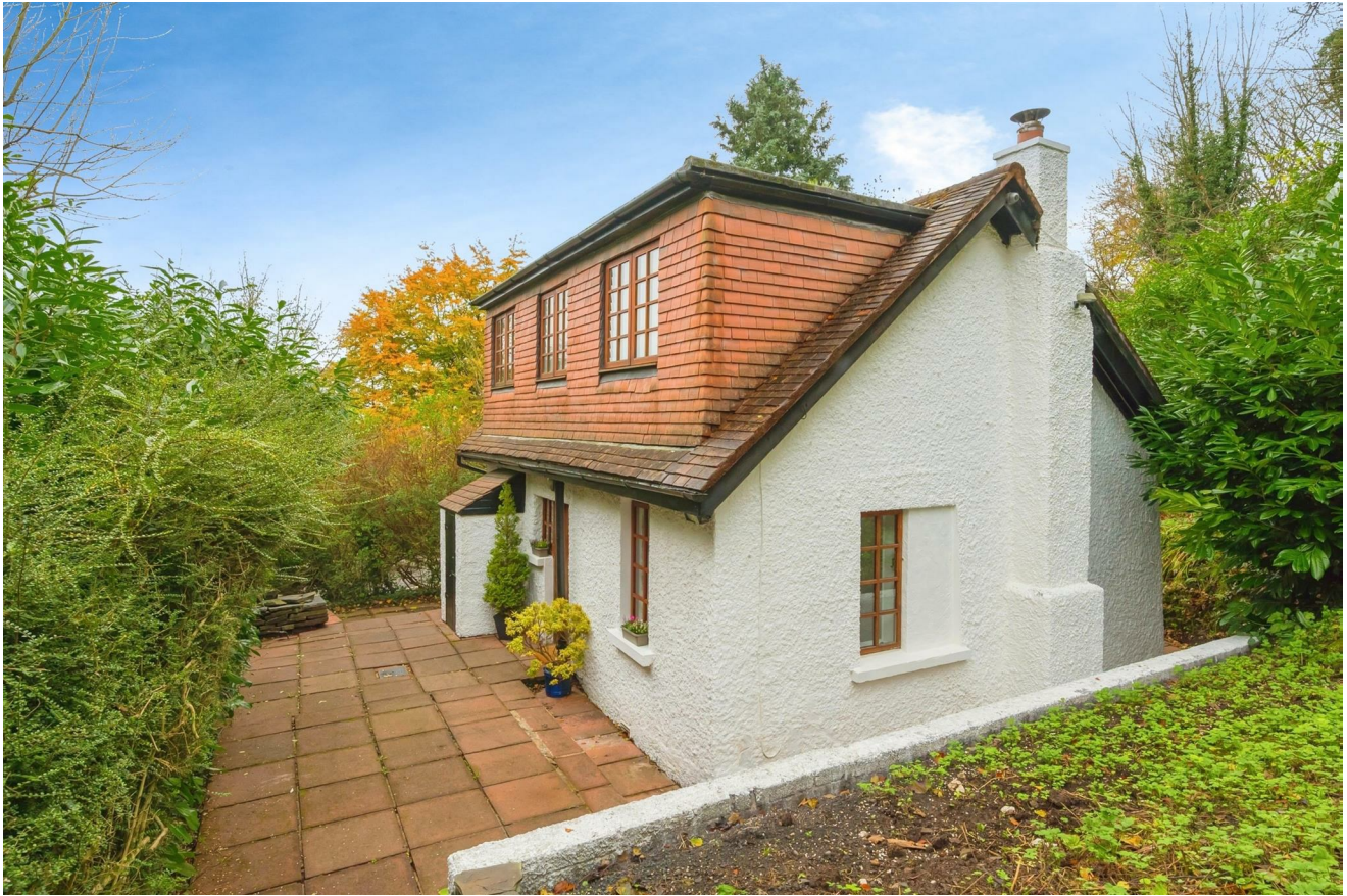
'Hazelwood Cottage', 48 Antrim Road, Newtownabbey, BT36 7PL