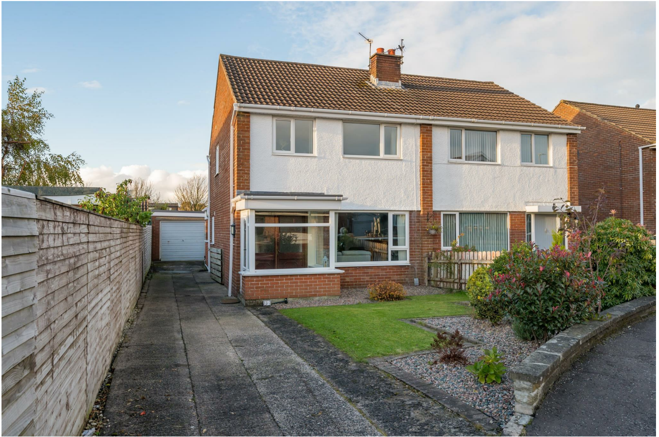
12 Ballyhenry Crescent, Newtownabbey, BT36 5BE