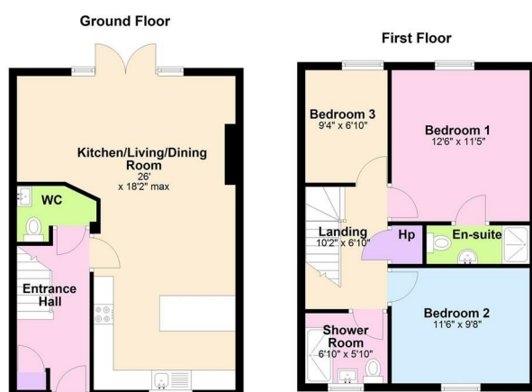
24 Hans Sloan Square, Killyleagh, Downpatrick

Terms & Conditions: Please note that these particulars do not constitute an offer or contract of sale. Any prospective purchaser should satisfy themselves by thorough inspection of the property and we recommend that any prospective purchaser should employ the professional services of a building surveyor and consider their findings prior to entering into contract. All such fees associated with this work will be the responsibility of the prospective purchaser regardless of whether the sale completes or not. In addition, none of the appliances or installations have been tested in any way whatsoever and it is our recommendation that a purchaser should fully satisfy themselves by employing an appropriate expert. We would also like to advise that our measurements are taken from the widest points of each room and should not be relied upon as completely accurate. You should not make decisions based on the measurements provided and double check measurements at all times. Valuation/Mortgage Service: As part of our service we would remind Vendors and potential purchasers that we have a Mortgage Broker available at this branch. If you are thinking of selling, we would be happy to carry out a free market appraisal of your property.