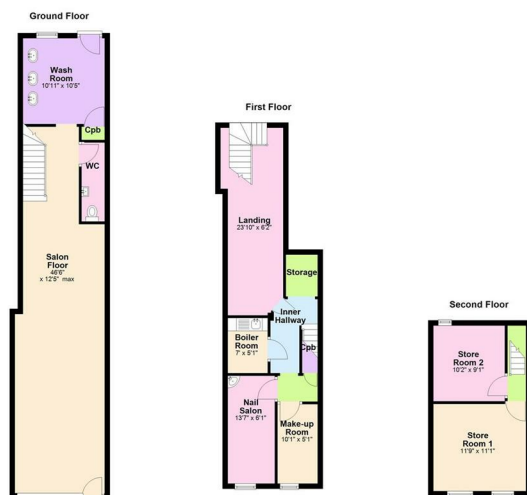
23 Bridge Street, Banbridge

Terms & Conditions: Please note that these particulars do not constitute an offer or contract of sale. Any prospective purchaser should satisfy themselves by thorough inspection of the property and we recommend that any prospective purchaser should employ the professional services of a building surveyor and consider their findings prior to entering into contract. All such fees associated with this work will be the responsibility of the prospective purchaser regardless of whether the sale completes or not. In addition, none of the appliances or installations have been tested in any way whatsoever and it is our recommendation that a purchaser should fully satisfy themselves by employing an appropriate expert. We would also like to advise that our measurements are taken from the widest points of each room and should not be relied upon as completely accurate. You should not make decisions based on the measurements provided and double check measurements at all times. Valuation/Mortgage Service: As part of our service we would remind Vendors and potential purchasers that we have a Mortgage Broker available at this branch. If you are thinking of selling, we would be happy to carry out a free market appraisal of your property.