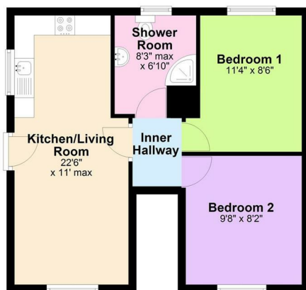
170a Banbridge Road, Kinallen, Dromore

Terms & Conditions: Please note that these particulars do not constitute an offer or contract of sale. Any prospective purchaser should satisfy themselves by thorough inspection of the property and we recommend that any prospective purchaser should employ the professional services of a building surveyor and consider their findings prior to entering into contract. All such fees associated with this work will be the responsibility of the prospective purchaser regardless of whether the sale completes or not. In addition, none of the appliances or installations have been tested in any way whatsoever and it is our recommendation that a purchaser should fully satisfy themselves by employing an appropriate expert. We would also like to advise that our measurements are taken from the widest points of each room and should not be relied upon as completely accurate. You should not make decisions based on the measurements provided and double check measurements at all times. Valuation/Mortgage Service: As part of our service we would remind Vendors and potential purchasers that we have a Mortgage Broker available at this branch. If you are thinking of selling, we would be happy to carry out a free market appraisal of your property.