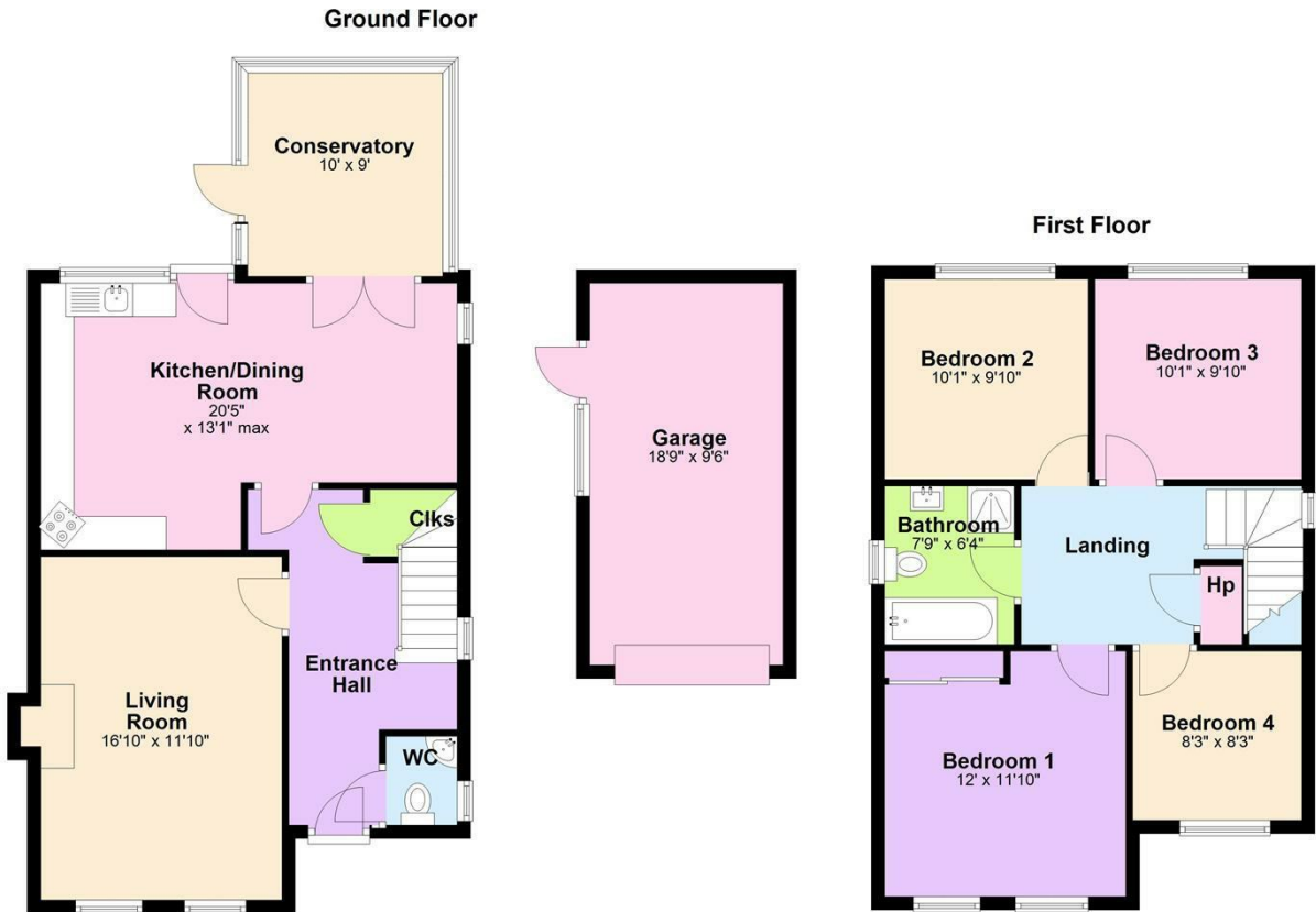
37 The Belfry, Dromore

If you require a viewing please get in contact via phone Leanne on 02840622226/07703612260 or email - banbridge@quinnestateagents.com