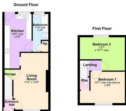
36 Burnview Terrace, Banbridge

Terms & Conditions: Please note that these particulars do not constitute an offer or contract of sale. Any prospective purchaser should satisfy themselves by thorough inspection of the property and we recommend that any prospective purchaser should employ the professional services of a building surveyor and consider their findings prior to entering into contract. All such fees associated with this work will be the responsibility of the prospective purchaser regardless of whether the sale completes or not. In addition, none of the appliances or installations have been tested in any way whatsoever and it is our recommendation that a purchaser should fully satisfy themselves by employing an appropriate expert. We would also like to advise that our measurements are taken from the widest points of each room and should not be relied upon as completely accurate. You should not make decisions based on the measurements provided and double check measurements at all times. Valuation/Mortgage Service: As part of our service we would remind Vendors and potential purchasers that we have a Mortgage Broker available at this branch. If you are thinking of selling, we would be happy to carry out a free market appraisal of your property.