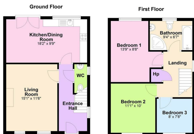
70 Whitethorn lane, Kinallen, Dromara

Terms & Conditions: Please note that these particulars do not constitute an offer or contract of sale. Any prospective purchaser should satisfy themselves by thorough inspection of the property and we recommend that any prospective purchaser should employ the professional services of a building surveyor and consider their findings prior to entering into contract. All such fees associated with this work will be the responsibility of the prospective purchaser regardless of whether the sale completes or not. In addition, none of the appliances or installations have been tested in any way whatsoever and it is our recommendation that a purchaser should fully satisfy themselves by employing an appropriate expert. We would also like to advise that our measurements are taken from the widest points of each room and should not be relied upon as completely accurate. You should not make decisions based on the measurements provided and double check measurements at all times. Valuation/Mortgage Service: As part of our service we would remind Vendors and potential purchasers that we have a Mortgage Broker available at this branch. If you are thinking of selling, we would be happy to carry out a free market appraisal of your property.