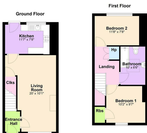
2 Burnview Terrace, Banbridge

If you require a viewing please get in contact via phone Leanne on 02840622226/07703612260 or email - banbridge@quinnestateagents.com