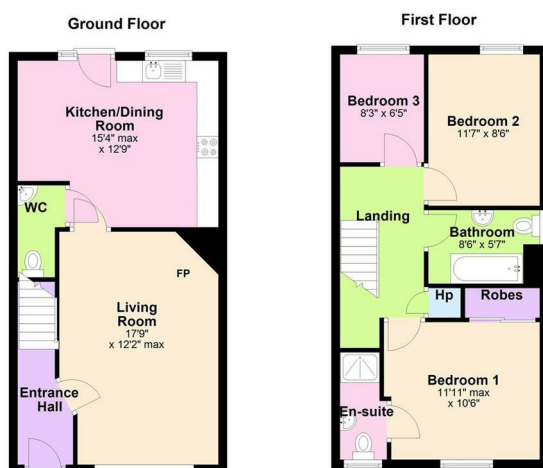
9 Riverview Heights, Ballynahinch

Terms & Conditions: Please note that these particulars do not constitute an offer or contract of sale. Any prospective purchaser should satisfy themselves by thorough inspection of the property and we recommend that any prospective purchaser should employ the professional services of a building surveyor and consider their findings prior to entering into contract. All such fees associated with this work will be the responsibility of the prospective purchaser regardless of whether the sale completes or not. In addition, none of the appliances or installations have been tested in any way whatsoever and it is our recommendation that a purchaser should fully satisfy themselves by employing an appropriate expert. We would also like to advise that our measurements are taken from the widest points of each room and should not be relied upon as completely accurate. You should not make decisions based on the measurements provided and double check measurements at all times. Valuation/Mortgage Service: As part of our service we would remind Vendors and potential purchasers that we have a Mortgage Broker available at this branch. If you are thinking of selling, we would be happy to carry out a free market appraisal of your property.