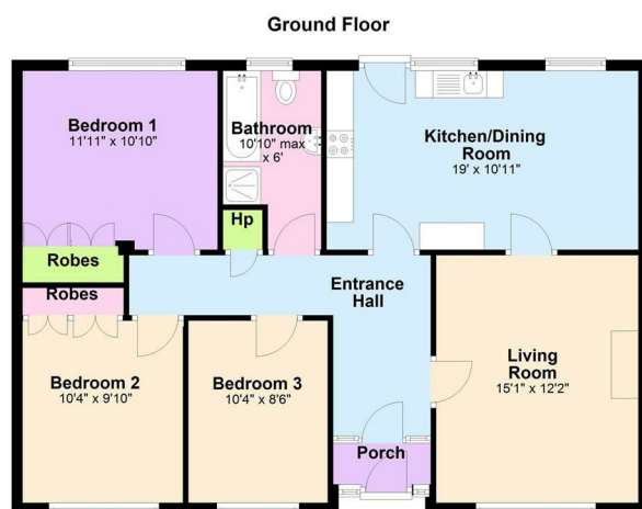
4 Glenlough, Ballynahinch

For more information or to schedule your own private appointment to see this property, please call Carrie on 02897564400 today or email all enquiries to ballynahinch@quinnestateagents.com