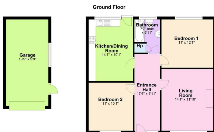
2 Glenlough Park, Ballynahinch

Terms & Conditions: Please note that these particulars do not constitute an offer or contract of sale. Any prospective purchaser should satisfy themselves by thorough inspection of the property and we recommend that any prospective purchaser should employ the professional services of a building surveyor and consider their findings prior to entering into contract. All such fees associated with this work will be the responsibility of the prospective purchaser regardless of whether the sale completes or not. In addition, none of the appliances or installations have been tested in any way whatsoever and it is our recommendation that a purchaser should fully satisfy themselves by employing an appropriate expert. We would also like to advise that our measurements are taken from the widest points of each room and should not be relied upon as completely accurate. You should not make decisions based on the measurements provided and double check measurements at all times. Valuation/Mortgage Service: As part of our service we would remind Vendors and potential purchasers that we have a Mortgage Broker available at this branch. If you are thinking of selling, we would be happy to carry out a free market appraisal of your property.