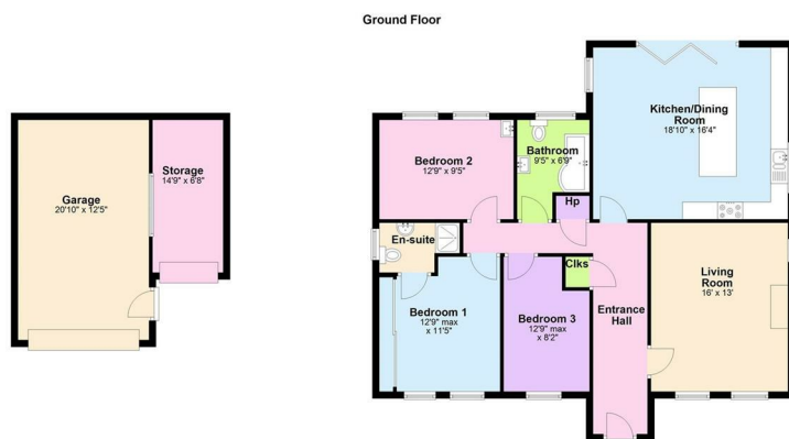
23 Kinedale Cottages, Ballynahinch

Terms & Conditions: Please note that these particulars do not constitute an offer or contract of sale. Any prospective purchaser should satisfy themselves by thorough inspection of the property and we recommend that any prospective purchaser should employ the professional services of a building surveyor and consider their findings prior to entering into contract. All such fees associated with this work will be the responsibility of the prospective purchaser regardless of whether the sale completes or not. In addition, none of the appliances or installations have been tested in any way whatsoever and it is our recommendation that a purchaser should fully satisfy themselves by employing an appropriate expert. We would also like to advise that our measurements are taken from the widest points of each room and should not be relied upon as completely accurate. You should not make decisions based on the measurements provided and double check measurements at all times. Valuation/Mortgage Service: As part of our service we would remind Vendors and potential purchasers that we have a Mortgage Broker available at this branch. If you are thinking of selling, we would be happy to carry out a free market appraisal of your property.