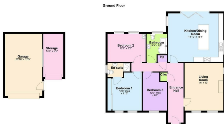
23 Kinedale Cottages, Ballynahinch

Terms & Conditions: Please note that these particulars do not constitute an offer or contract of sale. Any prospective purchaser should satisfy themselves by thorough inspection of the property and we recommend that any prospective purchaser should employ the professional services of a building surveyor and consider their findings prior to entering into contract. All such fees associated with this work will be the responsibility of the prospective purchaser regardless of whether the sale completes or not. In addition, none of the appliances or installations have been tested in any way whatsoever and it is our recommendation that a purchaser should fully satisfy themselves by employing an appropriate expert. We would also like to advise that our measurements are taken from the widest points of each room and should not be relied upon as completely accurate. You should not make decisions based on the measurements provided and double check measurements at all times. Valuation/Mortgage Service: As part of our service we would remind Vendors and potential purchasers that we have a Mortgage Broker available at this branch. If you are thinking of selling, we would be happy to carry out a free market appraisal of your property.