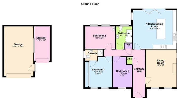
23 Kinedale Cottages, Ballynahinch

Terms & Conditions: Please note that these particulars do not constitute an offer or contract of sale. Any prospective purchaser should satisfy themselves by thorough inspection of the property and we recommend that any prospective purchaser should employ the professional services of a building surveyor and consider their findings prior to entering into contract. All such fees associated with this work will be the responsibility of the prospective purchaser regardless of whether the sale completes or not. In addition, none of the appliances or installations have been tested in any way whatsoever and it is our recommendation that a purchaser should fully satisfy themselves by employing an appropriate expert. We would also like to advise that our measurements are taken from the widest points of each room and should not be relied upon as completely accurate. You should not make decisions based on the measurements provided and double check measurements at all times. Valuation/Mortgage Service: As part of our service we would remind Vendors and potential purchasers that we have a Mortgage Broker available at this branch. If you are thinking of selling, we would be happy to carry out a free market appraisal of your property.