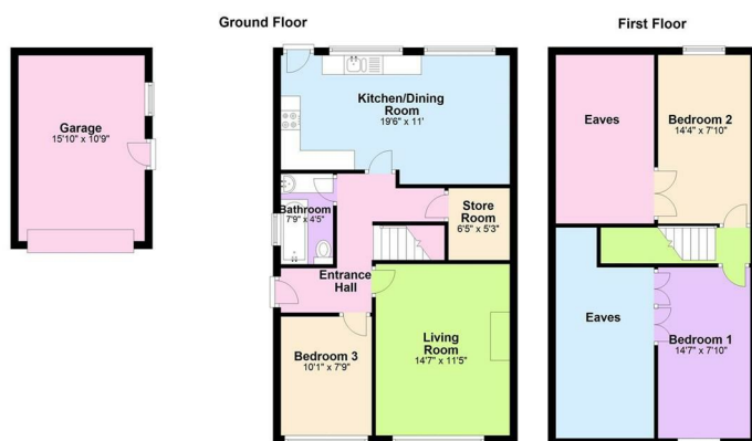
18 Carlisle Avenue, Ballynahinch

Terms & Conditions: Please note that these particulars do not constitute an offer or contract of sale. Any prospective purchaser should satisfy themselves by thorough inspection of the property and we recommend that any prospective purchaser should employ the professional services of a building surveyor and consider their findings prior to entering into contract. All such fees associated with this work will be the responsibility of the prospective purchaser regardless of whether the sale completes or not. In addition, none of the appliances or installations have been tested in any way whatsoever and it is our recommendation that a purchaser should fully satisfy themselves by employing an appropriate expert. We would also like to advise that our measurements are taken from the widest points of each room and should not be relied upon as completely accurate. You should not make decisions based on the measurements provided and double check measurements at all times. Valuation/Mortgage Service: As part of our service we would remind Vendors and potential purchasers that we have a Mortgage Broker available at this branch. If you are thinking of selling, we would be happy to carry out a free market appraisal of your property.