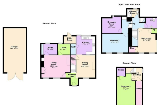
78 Grove Road, Spa

Terms & Conditions: Please note that these particulars do not constitute an offer or contract of sale. Any prospective purchaser should satisfy themselves by thorough inspection of the property and we recommend that any prospective purchaser should employ the professional services of a building surveyor and consider their findings prior to entering into contract. All such fees associated with this work will be the responsibility of the prospective purchaser regardless of whether the sale completes or not. In addition, none of the appliances or installations have been tested in any way whatsoever and it is our recommendation that a purchaser should fully satisfy themselves by employing an appropriate expert. We would also like to advise that our measurements are taken from the widest points of each room and should not be relied upon as completely accurate. You should not make decisions based on the measurements provided and double check measurements at all times. Valuation/Mortgage Service: As part of our service we would remind Vendors and potential purchasers that we have a Mortgage Broker available at this branch. If you are thinking of selling, we would be happy to carry out a free market appraisal of your property.