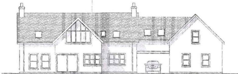
Rear Elevation (South) as Proposed