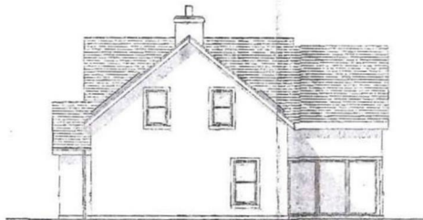
Right Elevation (West) as Proposed