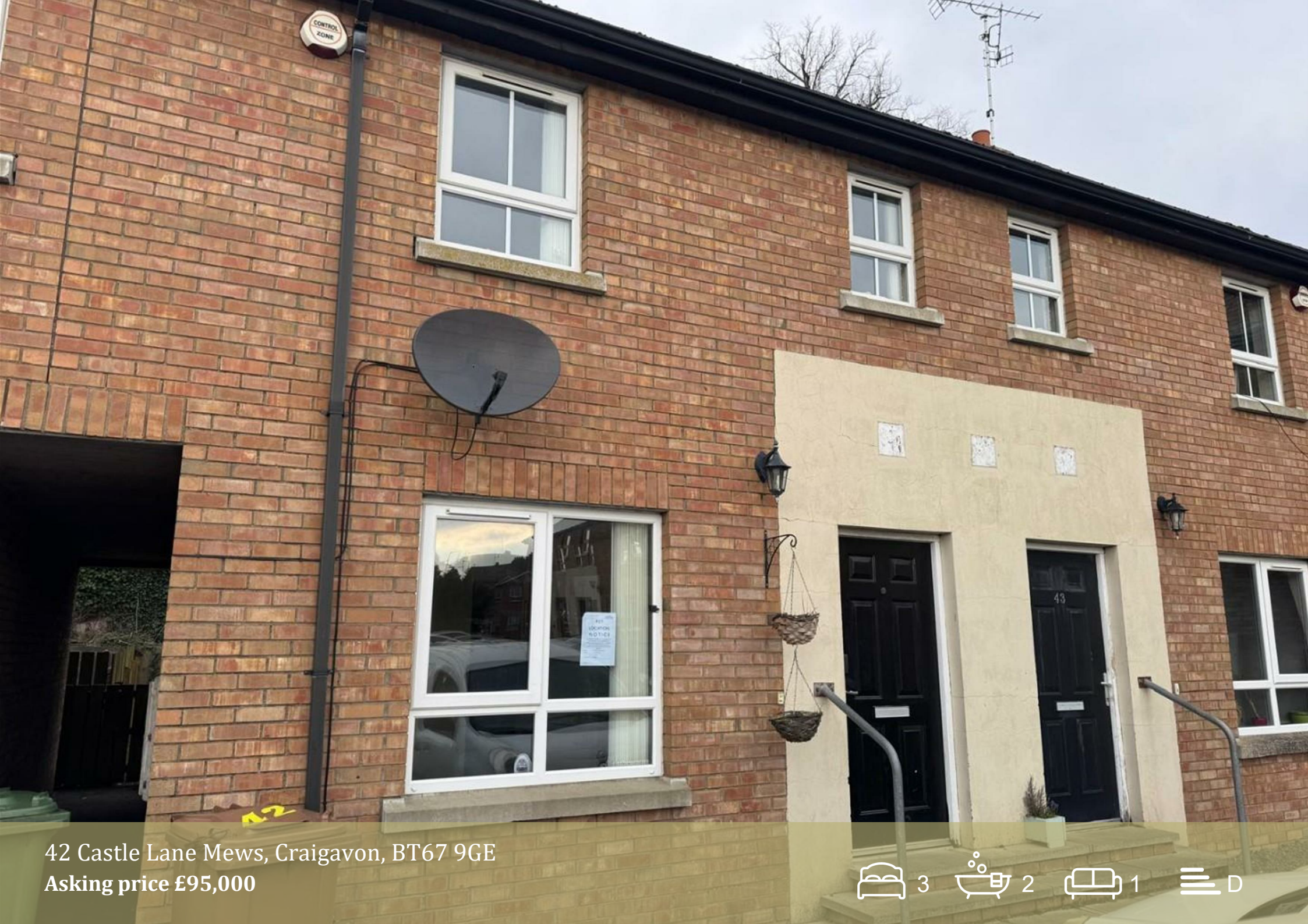
42 Castle Lane Mews, Craigavon, BT67 9GE Asking price £95,000