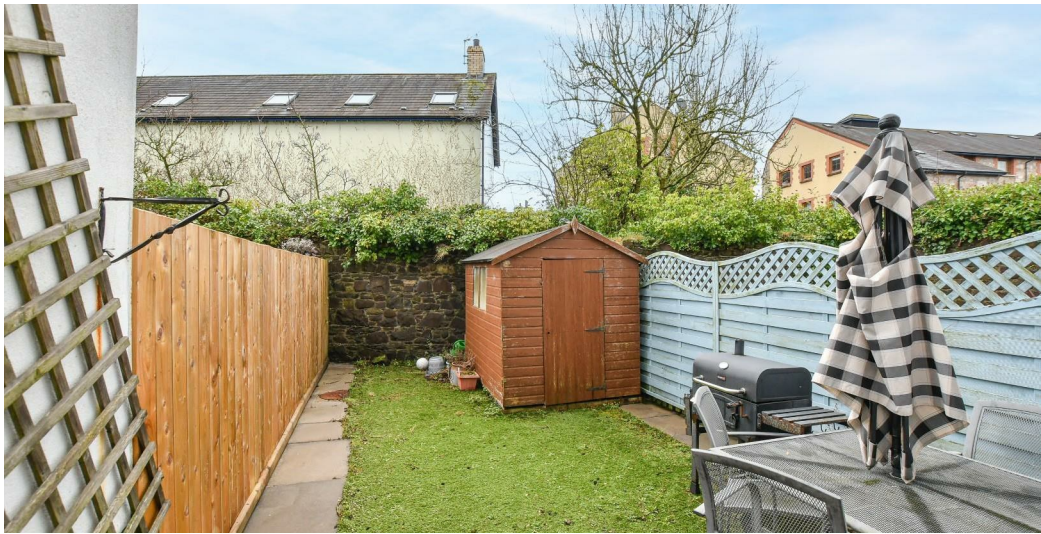
TYPE ROOM NAME HERE