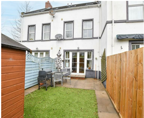
TYPE ROOM NAME HERE