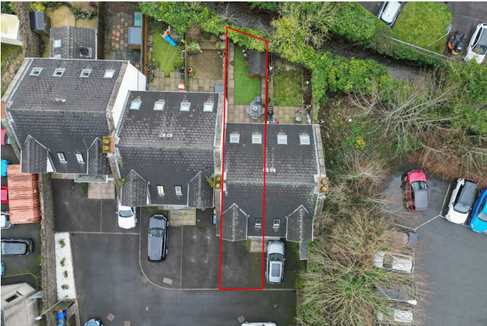
TYPE ROOM NAME HERE