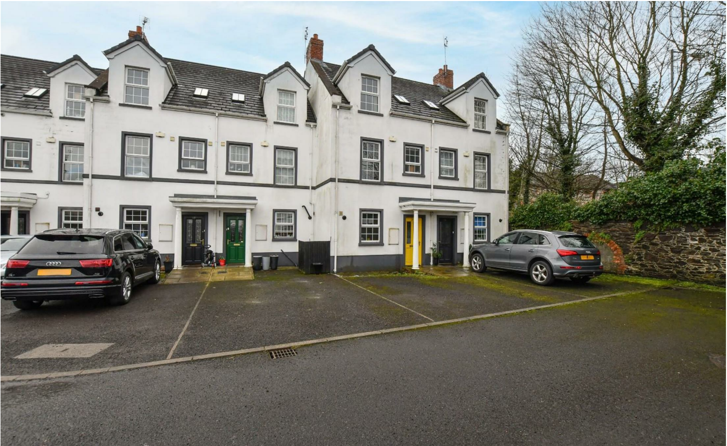
TYPE ROOM NAME HERE

Don't miss this opportunity—book your viewing today!