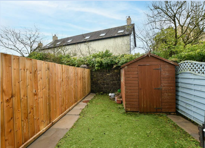
TYPE ROOM NAME HERE