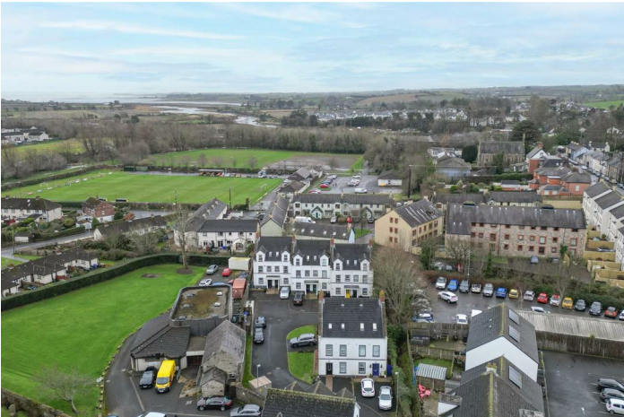
TYPE ROOM NAME HERE