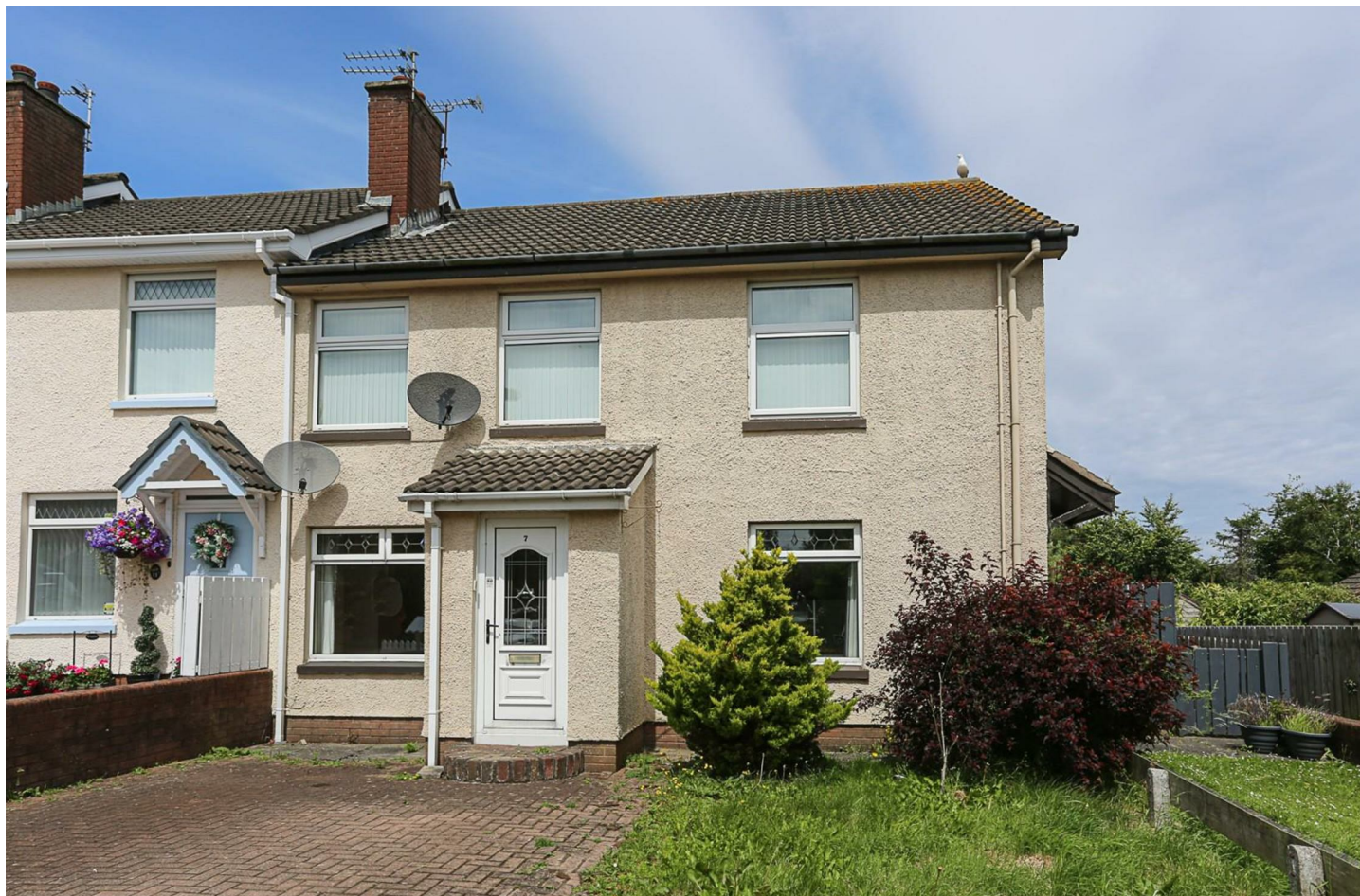
7 Willowbrook Gardens Bangor, BT19 7GQ