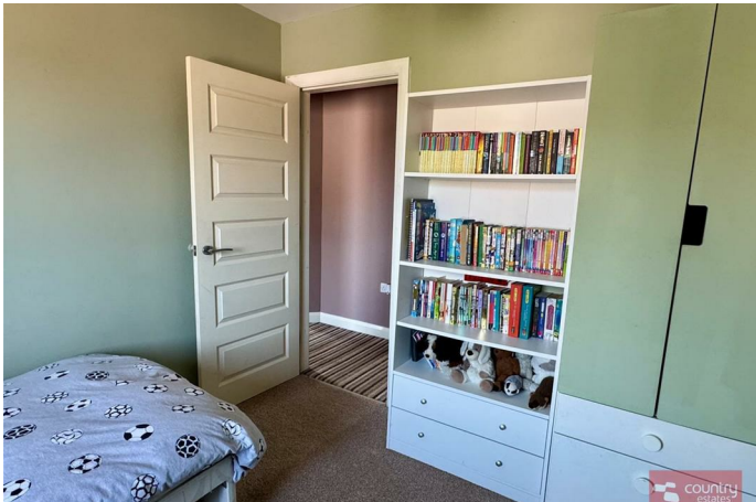
BEDROOM 3 10'7" x 8'6"