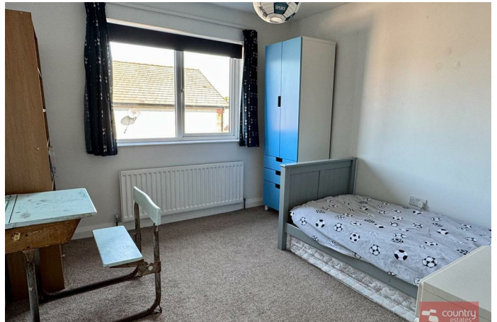
BEDROOM 4 10'4" x 6'8"