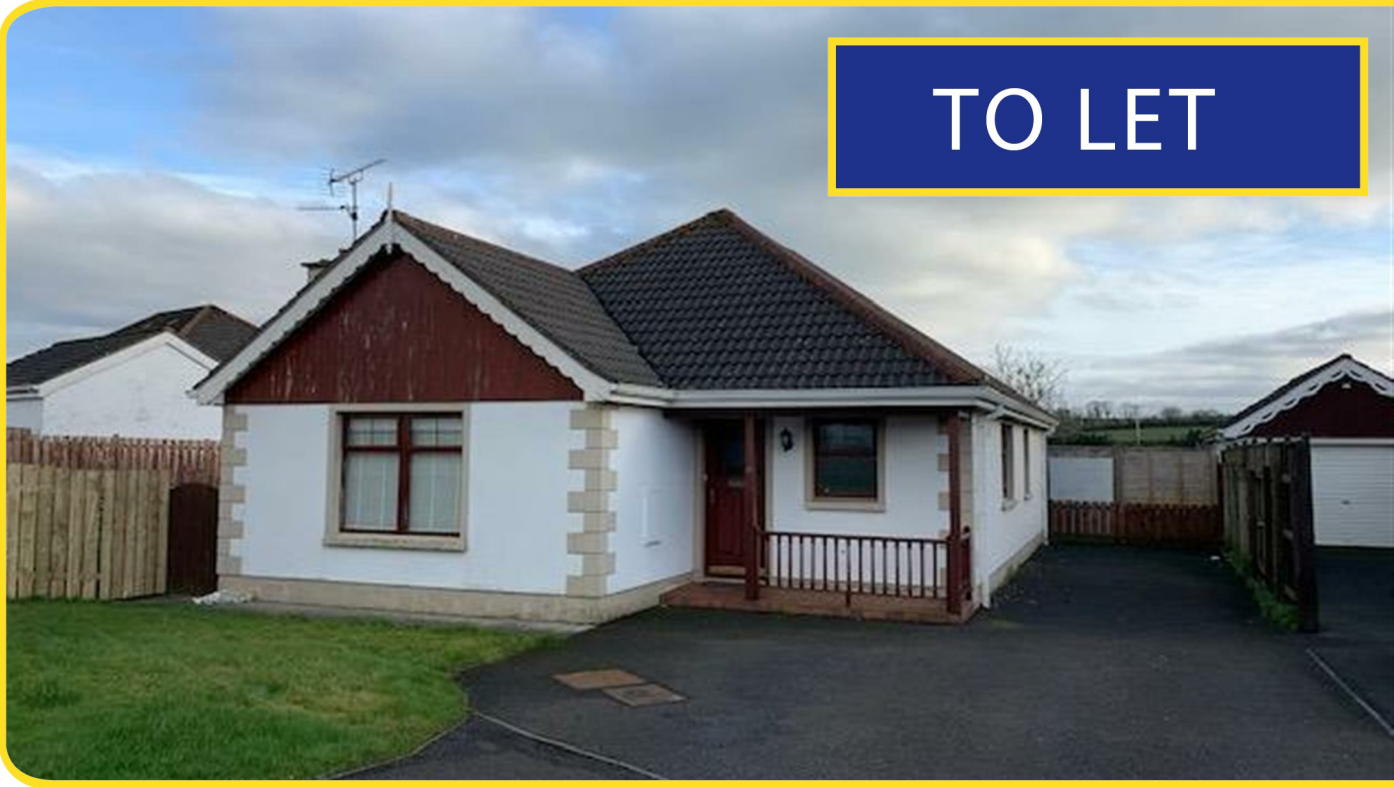
87 Rose Park, Limavady, BT49 0BF