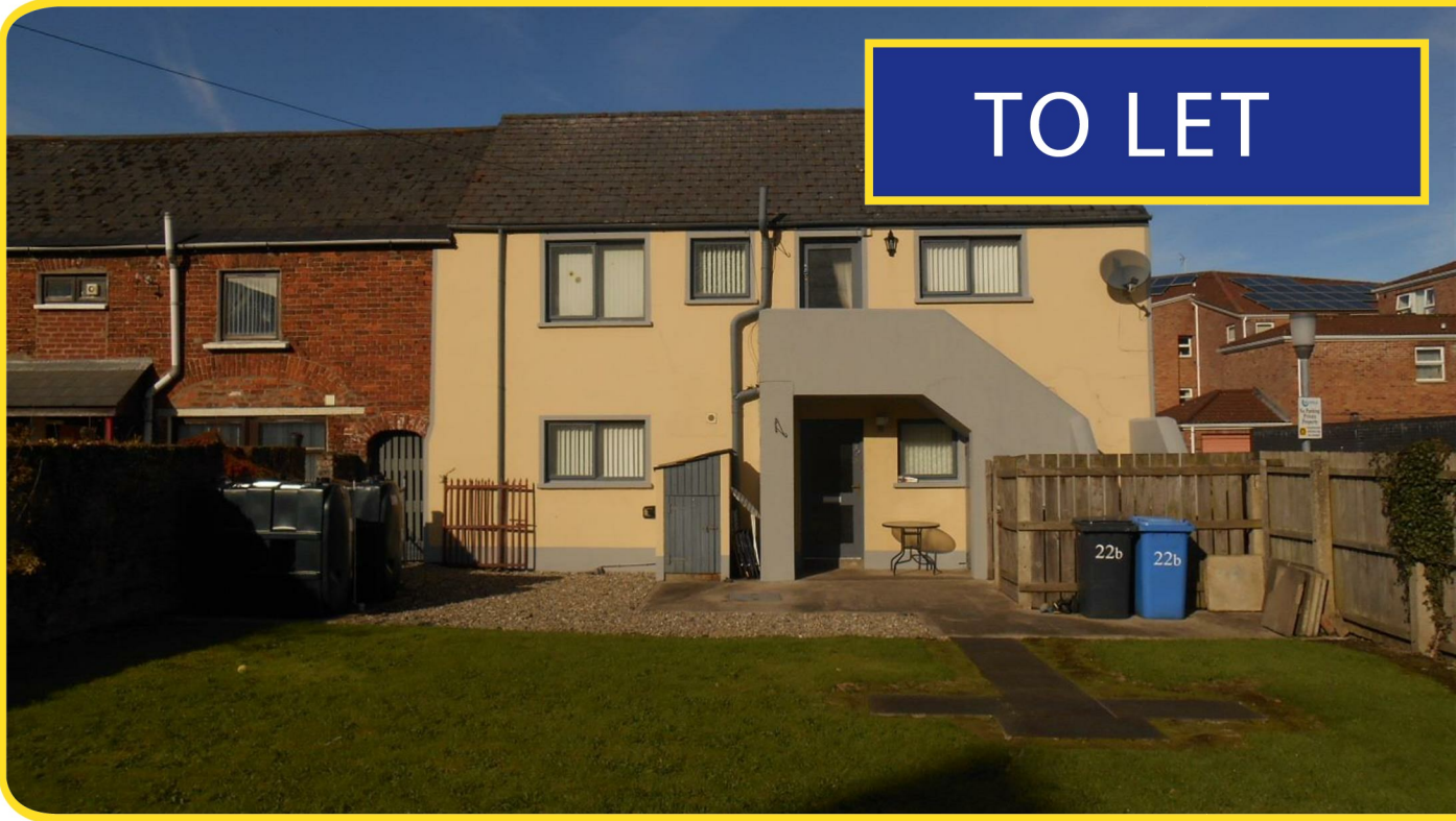
22A Main Street, Limavady, BT49 0EU