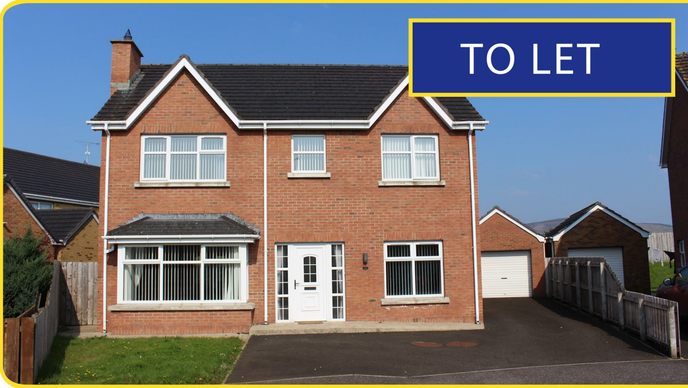
28 Gortenanima, Limavady, BT49 0GF