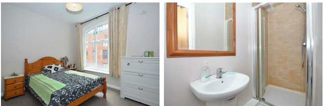
Master Bedroom 6'6" x 13'3"