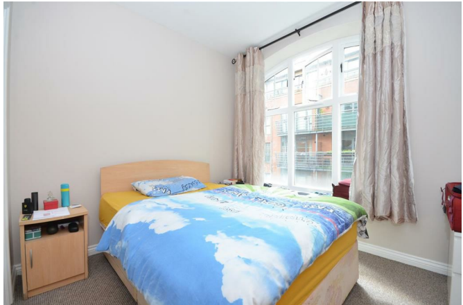
Bedroom 2 10'10" x 9'11"

These particulars are intended only as general guidance. The Company therefore gives notice that none of the material issued or visual depictions of any kind made on behalf of the Company can be relied upon as accurately describing any of the Specified Matters prescribed by any Order made under the Property Misdescriptions Act 1991. Nor do they constitute a contract, part of a contract or a warranty. Floor plan is for illustrative purposes only. Measurements are approximate and not to scale.