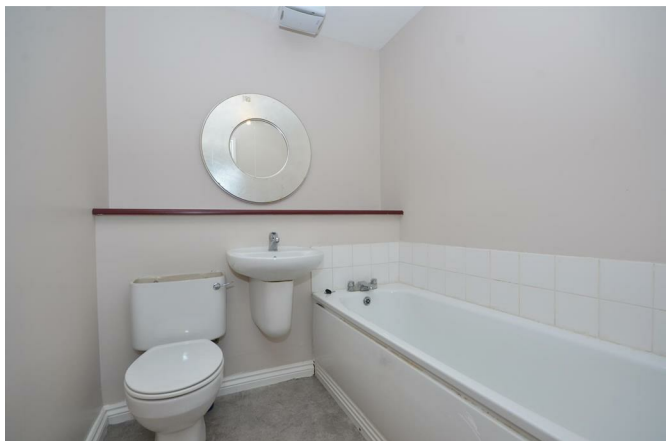
Bathroom 8'2" x 6'9"

Vinyl flooring; three piece white bathroom suite; shower over bath; radiator; extractor fan;