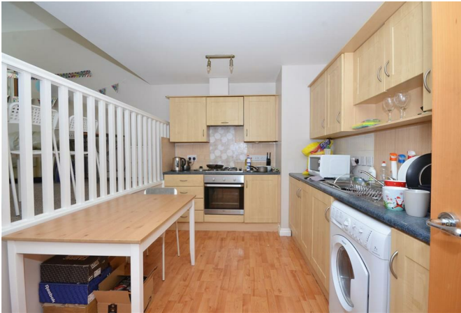
Kitchen 8'2" x 12'10"