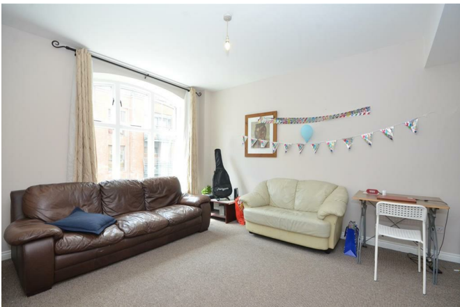
Living/Dining Room 14'1" x 11'5"