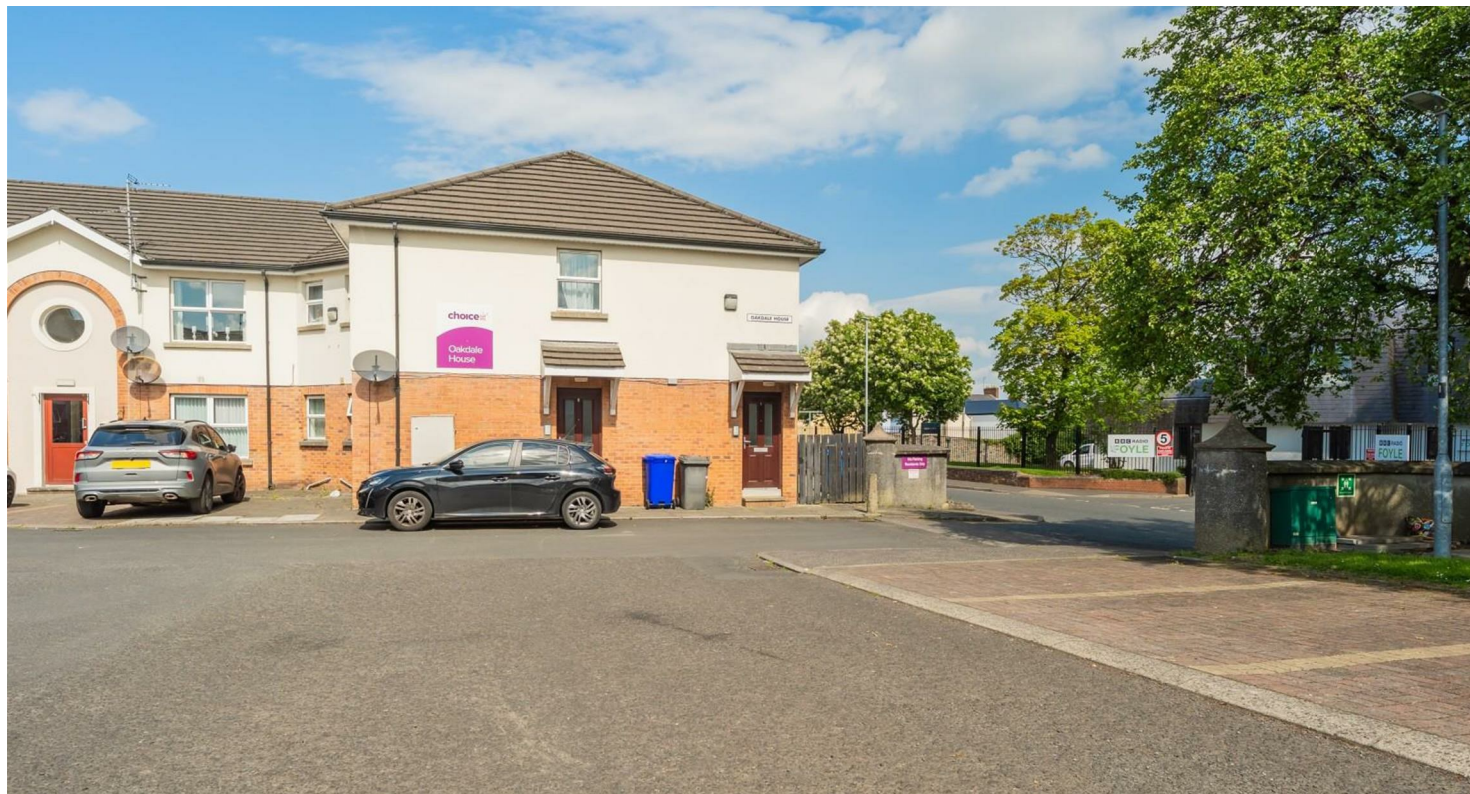
3 Oakdale house, Northland Road, Derry, £950 Per Month