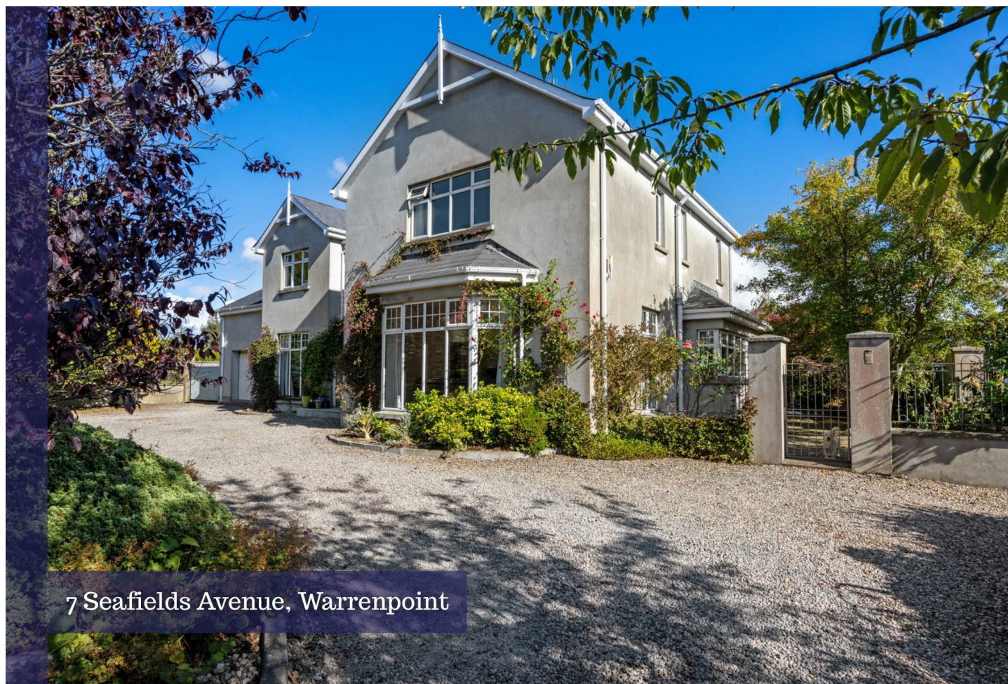
7 Seafields Avenue, Warrenpoint