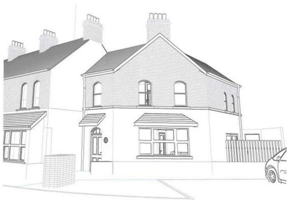
low level front view