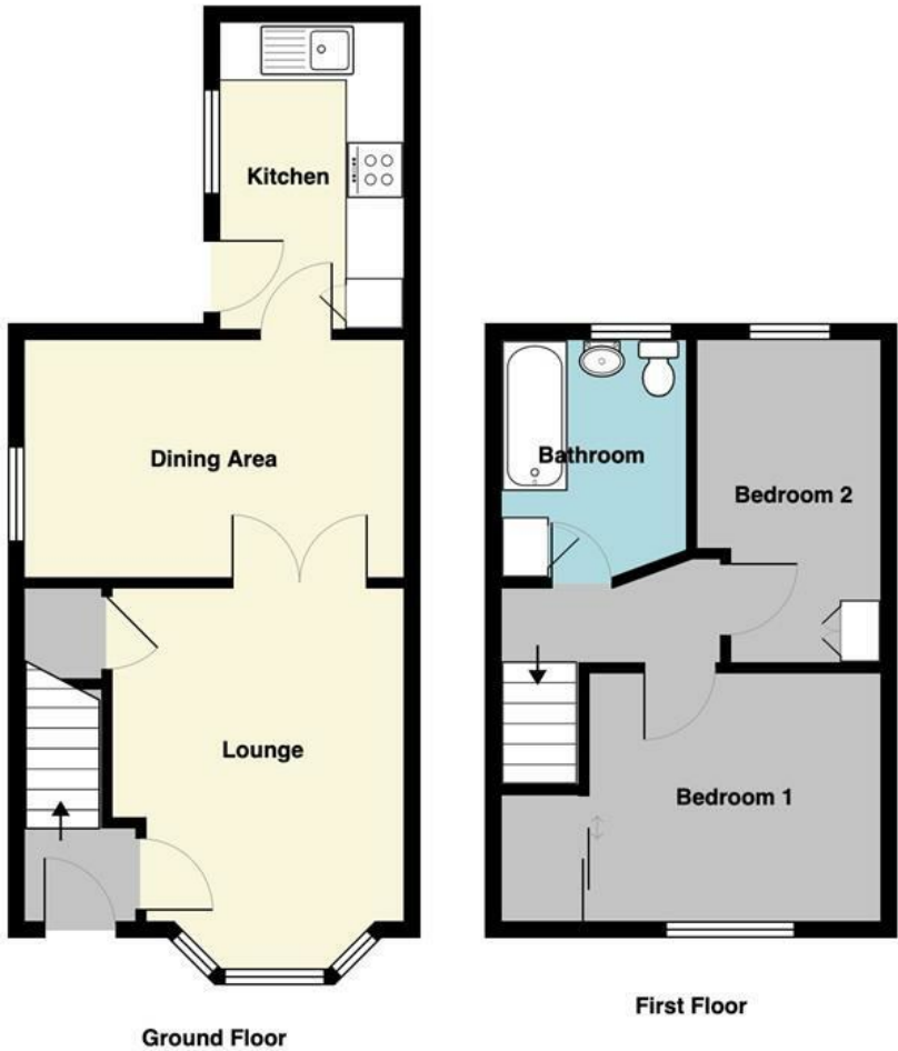
Total Area: 56.6 m² ... 610 ft² All measurements are approximate and for display purposes only

These particulars, whilst believed to be accurate are set out as a general outline only for guidance and do not constitute any part of an offer or contract. Intending purchasers should not rely on them as statements of representation of fact, but must satisfy themselves by inspection or otherwise as to their accuracy. No person in this firms employment has the authority to make or give any representation or warranty in respect of the property.