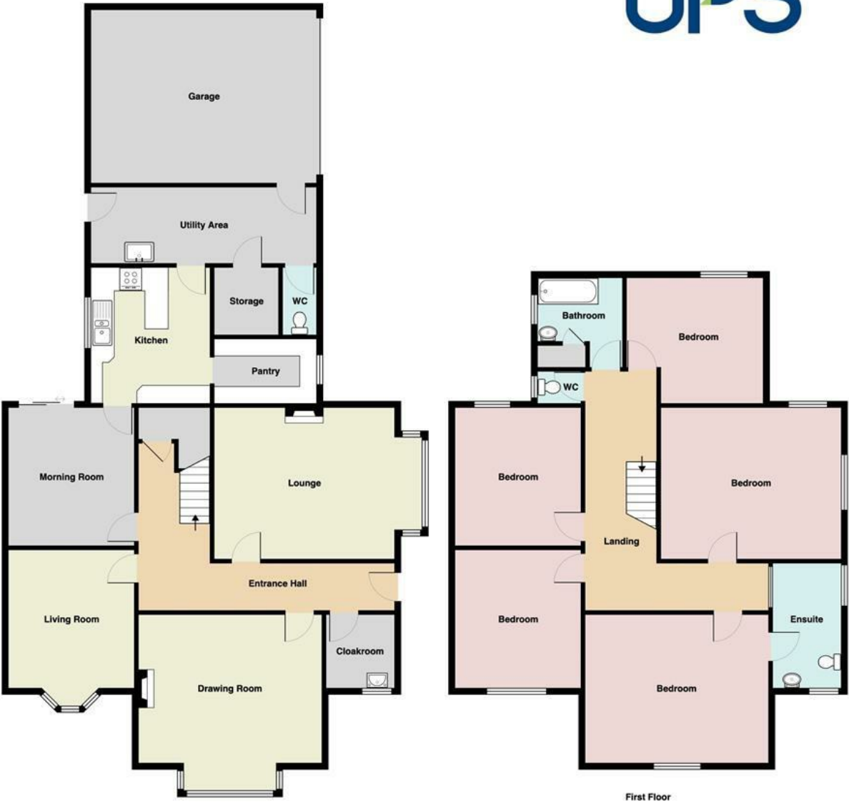
Total Area: 208.8 m² ... 2248 ft² (excluding garage, utility area, wc, storage) All measurements are approximate and for display purposes only

These particulars, whilst believed to be accurate are set out as a general outline only for guidance and do not constitute any part of an offer or contract. Intending purchasers should not rely on them as statements of representation of fact, but must satisfy themselves by inspection or otherwise as to their accuracy. No person in this firms employment has the authority to make or give any representation or warranty in respect of the property.