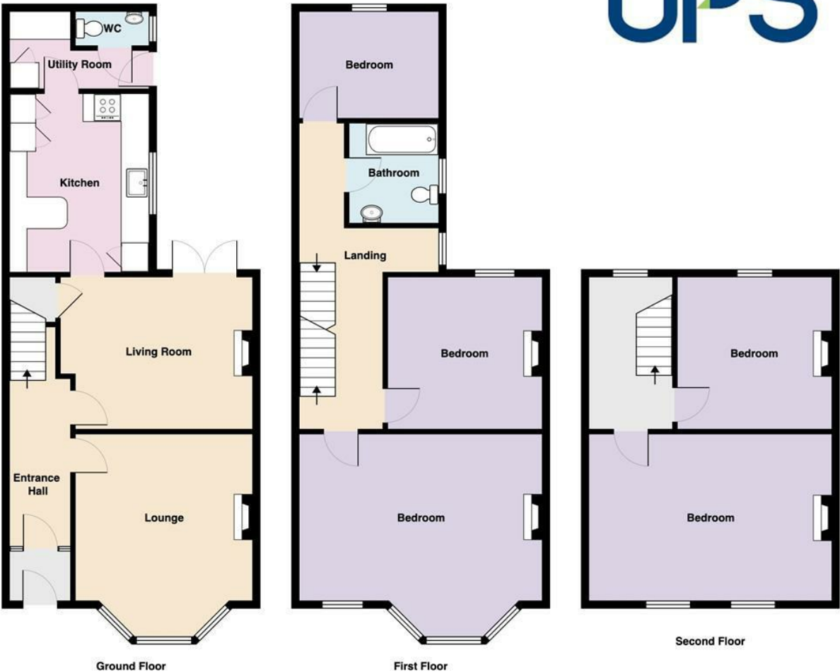
Total Area: 153.1 m² ... 1647 ft² All measurements are approximate and for display purposes only

These particulars, whilst believed to be accurate are set out as a general outline only for guidance and do not constitute any part of an offer or contract. Intending purchasers should not rely on them as statements of representation of fact, but must satisfy themselves by inspection or otherwise as to their accuracy. No person in this firms employment has the authority to make or give any representation or warranty in respect of the property.