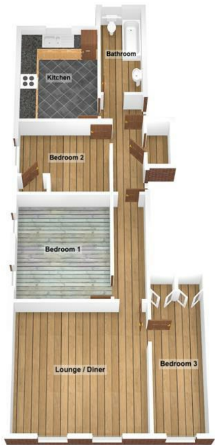
Total Area: 83.6 m² ... 899 ft² All measurements are approximate and for display purposes only

Apartment 5, Ardilea House, BELFAST, BT15 5DW