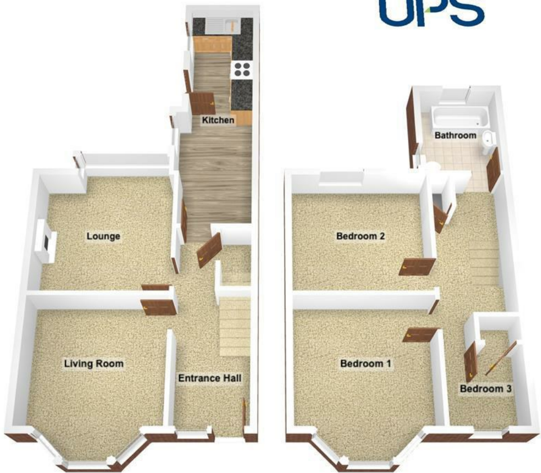
Ground Floor First Floor Total Area: 92.4 m² ... 994 ft² All measurements are approximate and for display purposes only

These particulars, whilst believed to be accurate are set out as a general outline only for guidance and do not constitute any part of an offer or contract. Intending purchasers should not rely on them as statements of representation of fact, but must satisfy themselves by inspection or otherwise as to their accuracy. No person in this firms employment has the authority to make or give any representation or warranty in respect of the property.