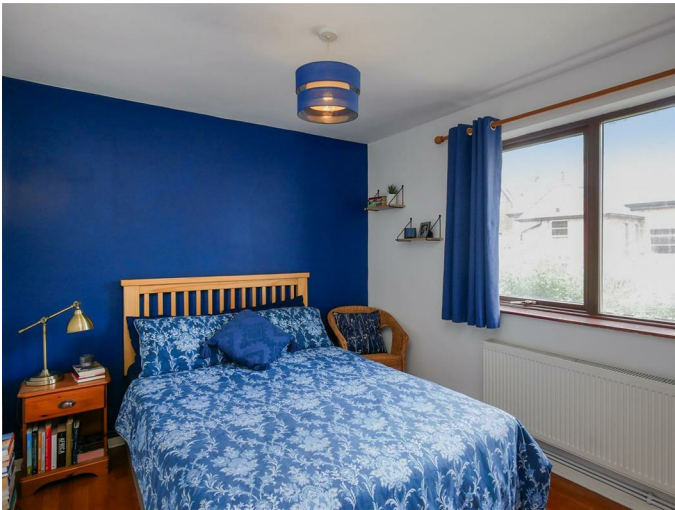
Double mirrored sliding robes. Laminate flooring.