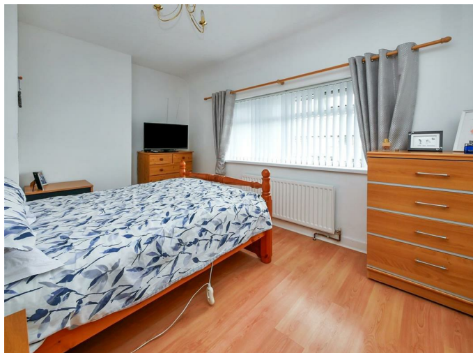
Bedroom 1 15'6 x 9'5 (4.72m x 2.87m)

Laminate flooring, wall to wall sliding robes, original built in robe also behind the sliding doors. Additional storage in the former hot press.