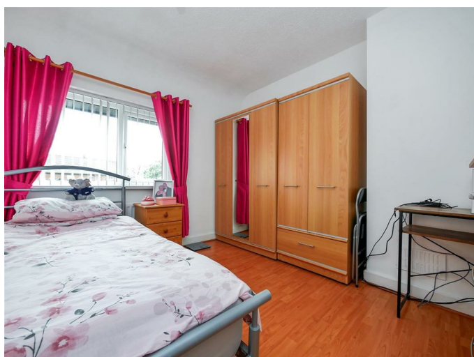
Bedroom 2 10'5 x 9'3 (3.18m x 2.82m)

Laminate flooring, wall to wall sliding robes, original built in robe also behind the sliding doors. Additional storage in the former hot press.