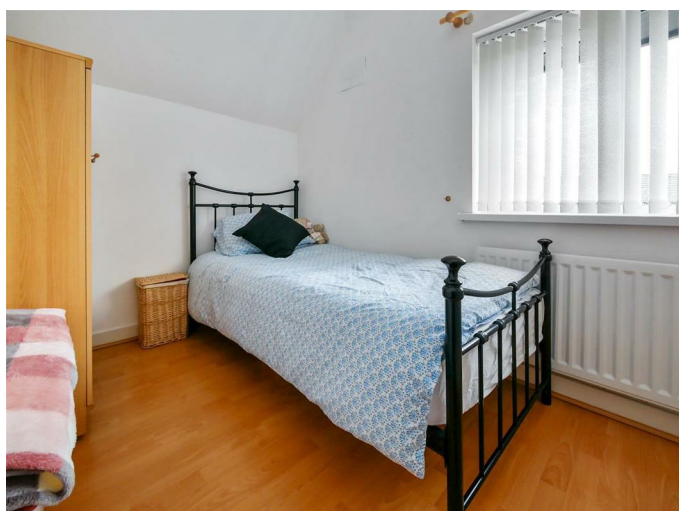
Bedroom 3 9'1 x 7'1 (2.77m x 2.16m)