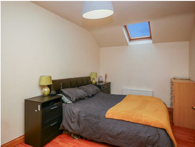
Laminate flooring. Access to robes.