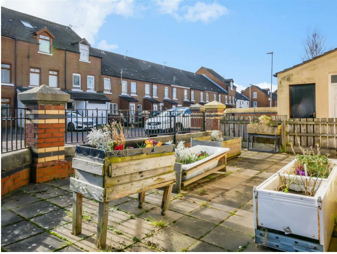
Front to side patio.